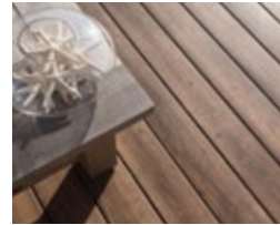
ZURI® PREMIUM DECKING