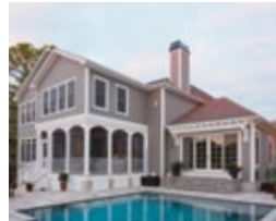
CELECT® CELLULAR COMPOSITE SIDING